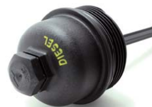
Oil Filter Cup For Mercedes-Benz