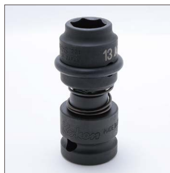
14444WA + 14401MS-13

⚠ It is strongly recommended that a torque control device be utilized in applications involving the 13333WA and 14444WA adaptors as the reduced square drive design decreases the overall torque ratings.